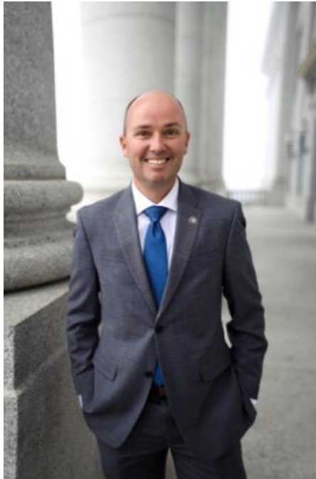
Lt. Governor Spencer Cox