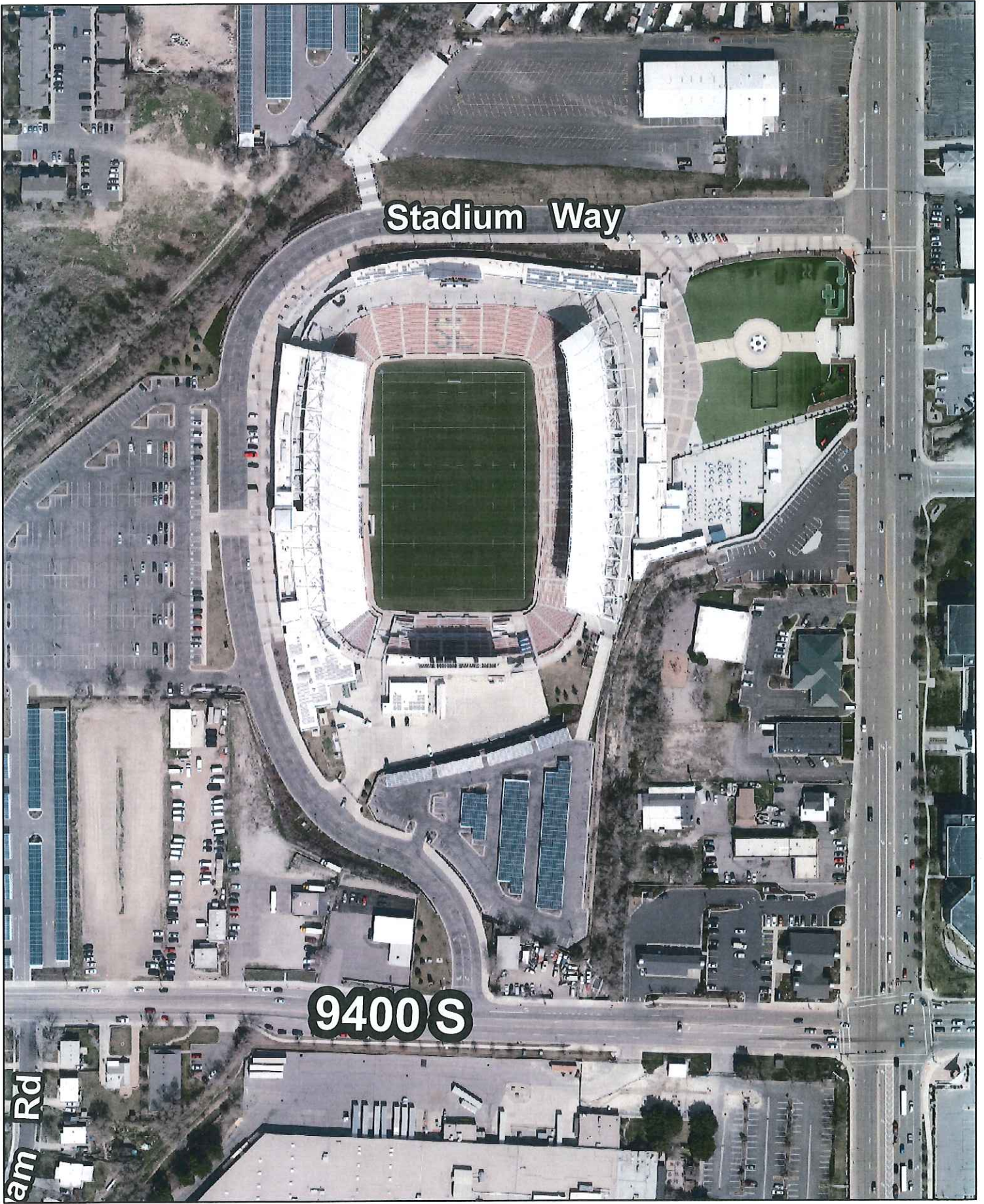
Stadium Way Location Map