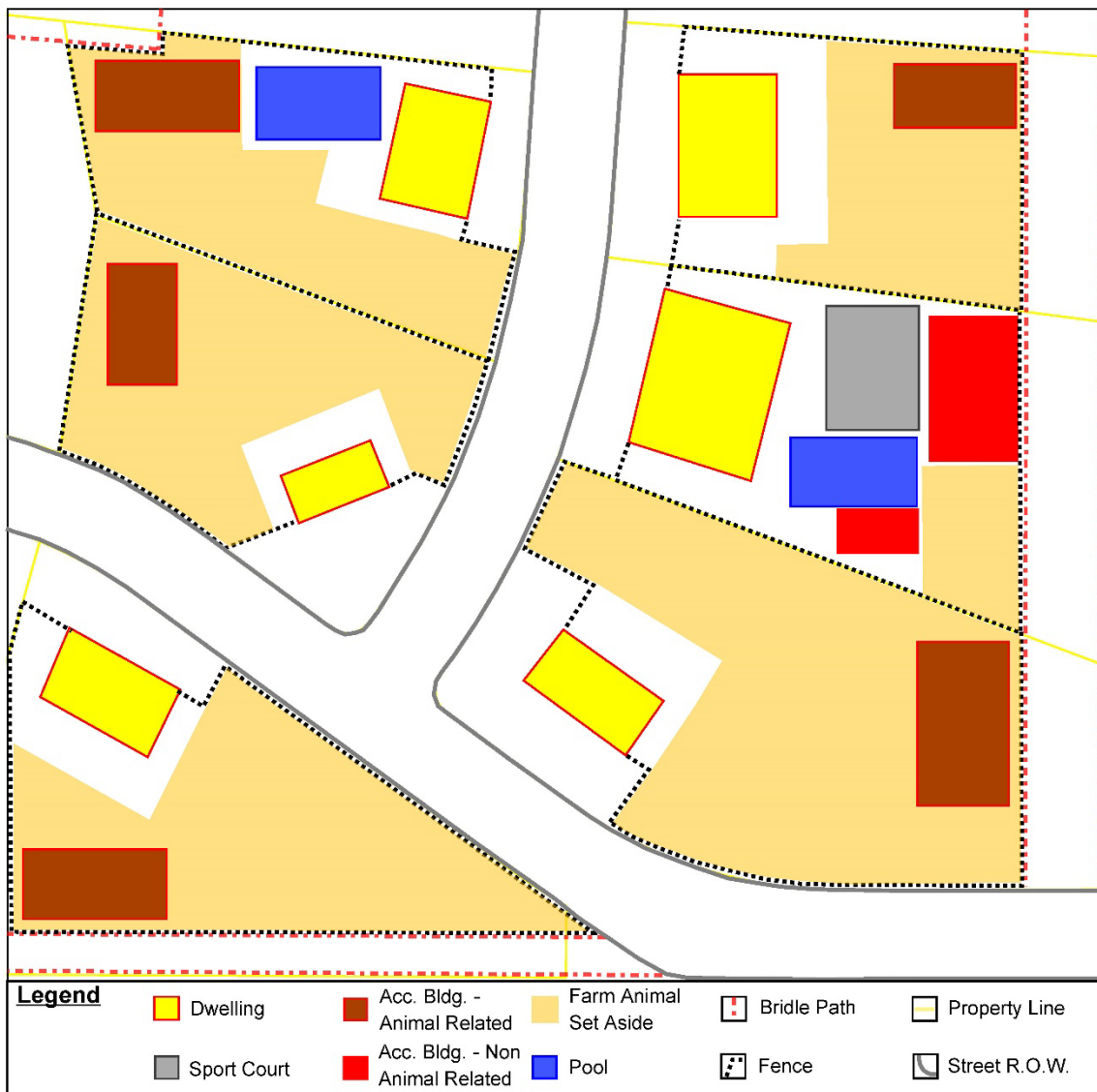
Figure 1 - Diagram of Farm Animal Set Aside Area (not drawn to scale)

farm animal housing and containment are not allowed within the farm animal area set aside. The farm animal area set aside may not be used at any time for residential dwellings (see Figure 1).