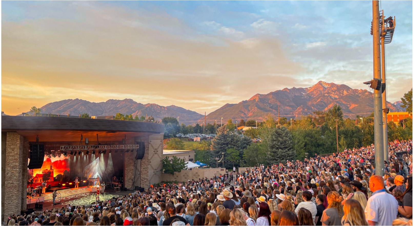
Sandy Amphitheater | June 2023