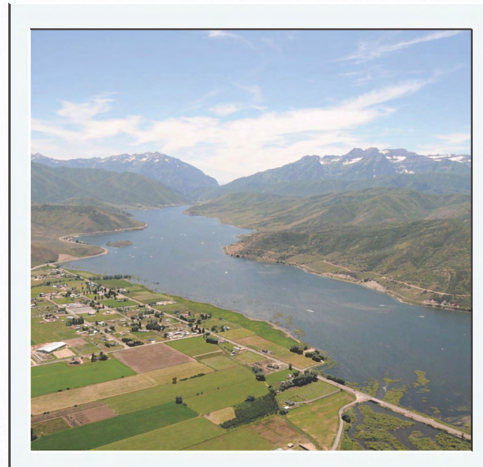
PROVO RIVER PROJECT Deer Creek Reservoir 61,900 AF