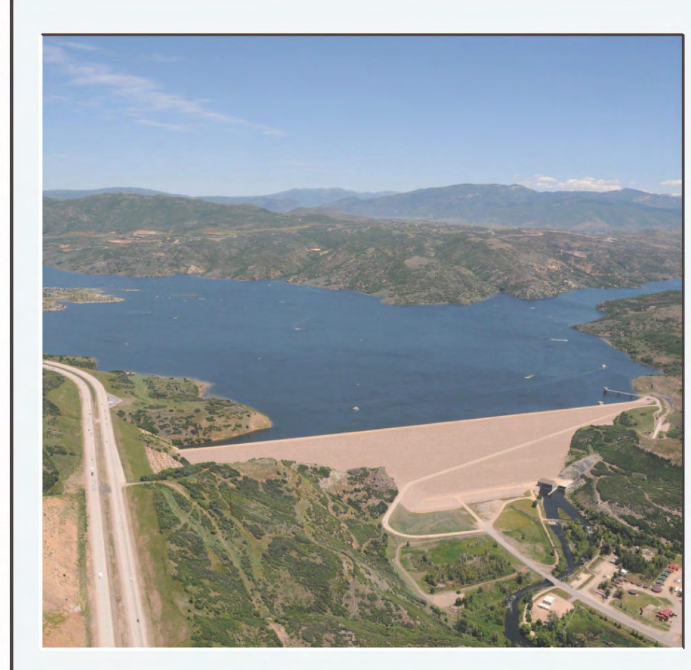
CENTRAL UTAH PROJECT Jordanelle Reservoir 20,000 AF