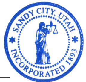
Monica Zoltanski, Mayor

PRESENTED to the Mayor of Sandy City this 15 th day of November , 2024.