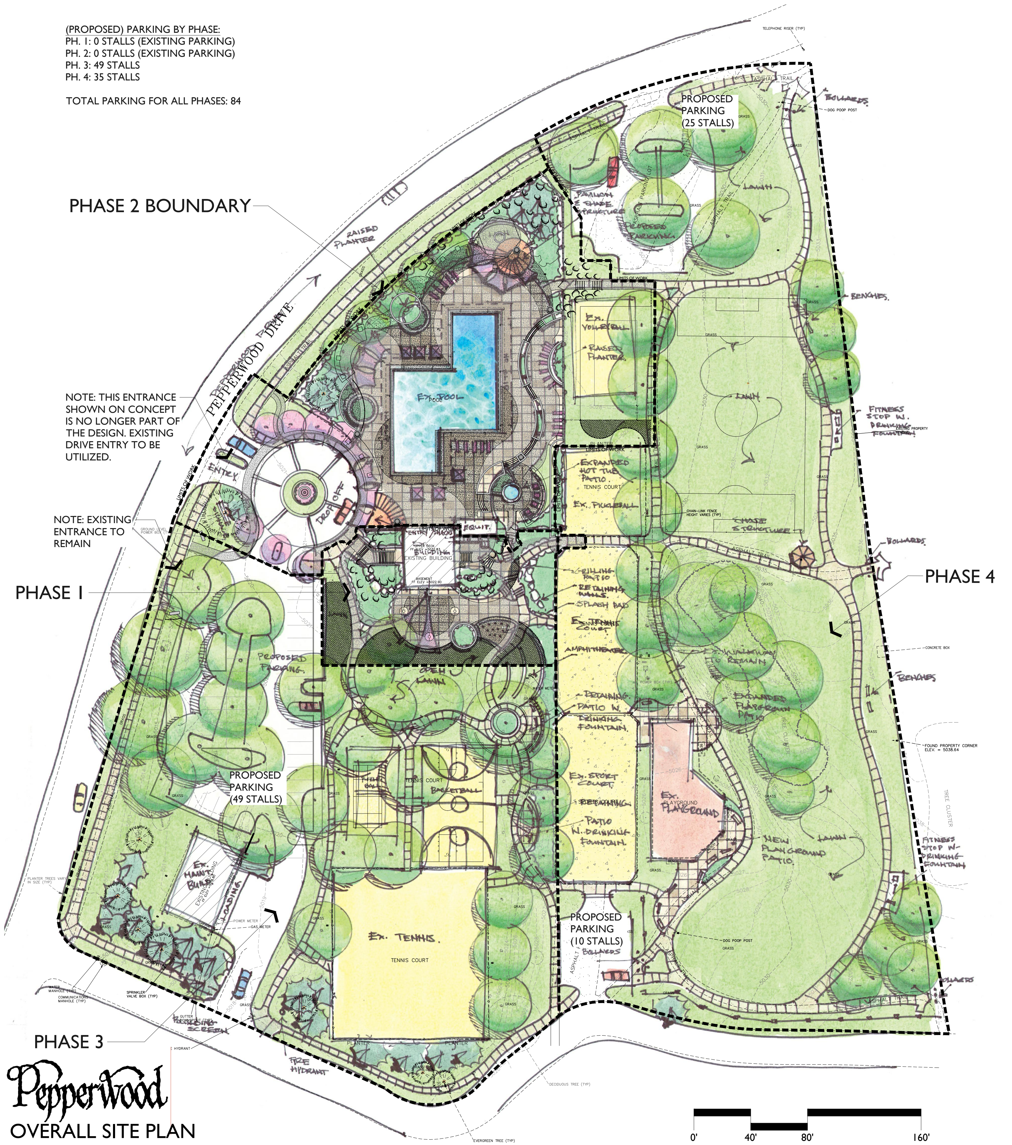
PHASE 3 Pepperwood OVERALL SITE PLAN

(PROPOSED) PARKING BY PHASE: PH. 1: 0 STALLS (EXISTING PARKING) PH. 2: 0 STALLS (EXISTING PARKING) PH. 3: 49 STALLS PH. 4: 35 STALLS TOTAL PARKING FOR ALL PHASES: 84