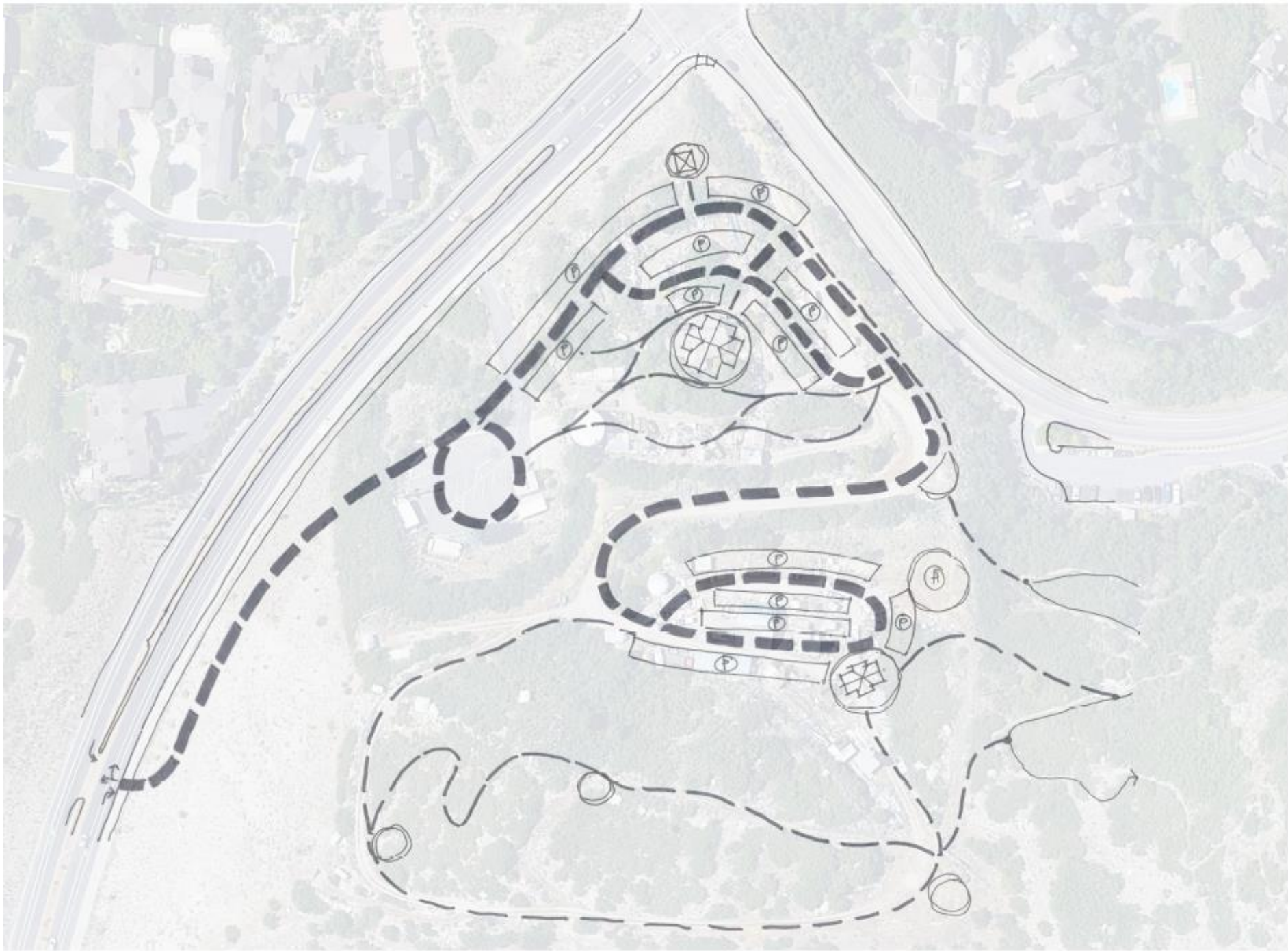
Bell Canyon Preservation Trailhead | Option 1