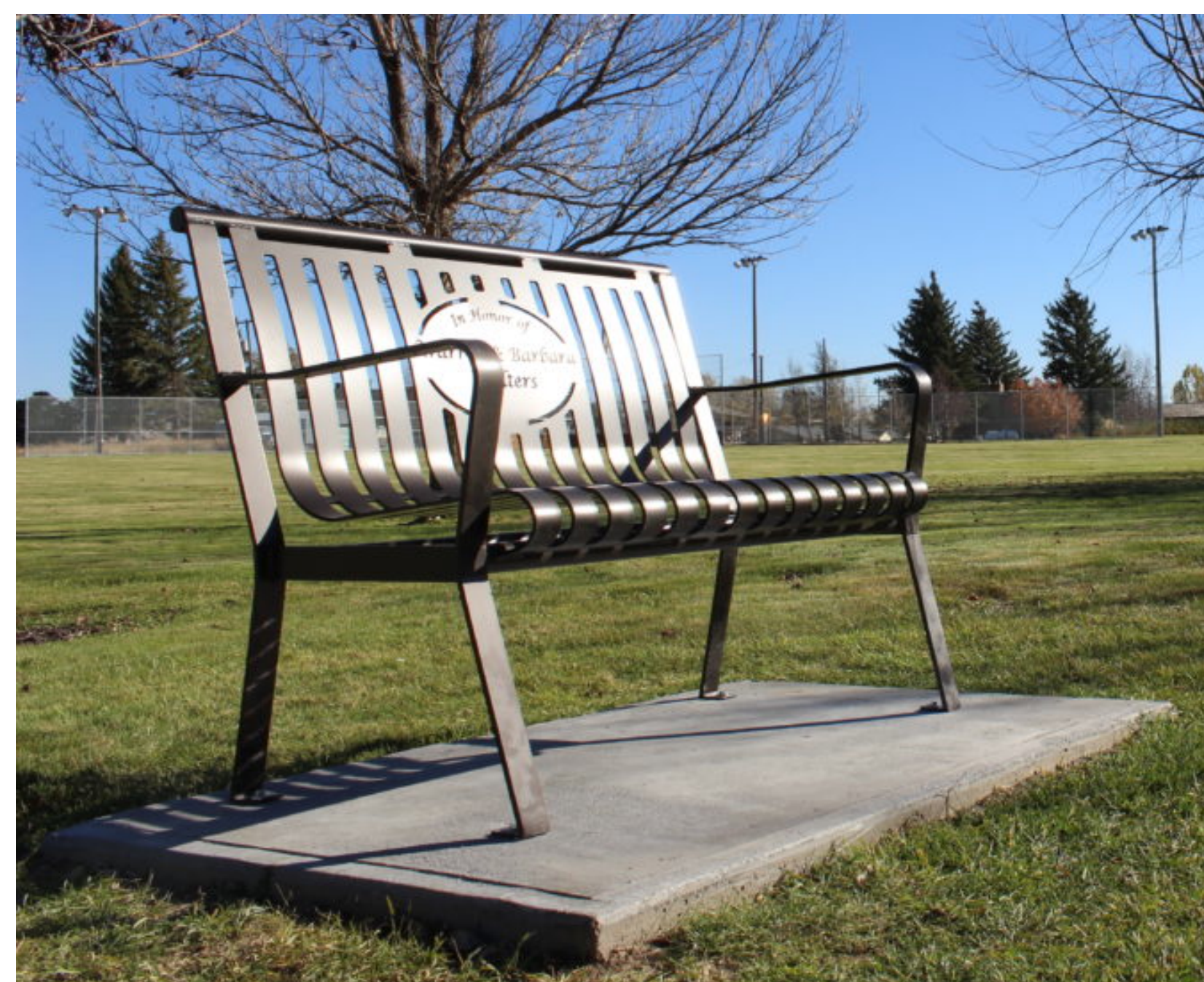
Sugar Maple Bench - Model # SM400