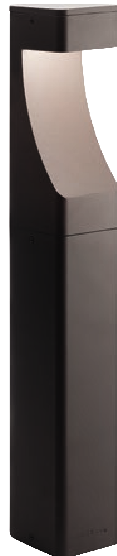
Kichler Model # 15848 12V Textured Bollard Path Light

Height 27" / 685.80mm Length 5.50" / 140mm Width 4" / 102mm Housing Material Cast Aluminum Weight Alum 7.8 lbs / 3.5 kg