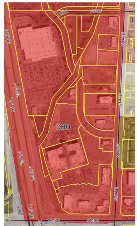
Figure 1 - CBD Zone Area

There is not an existing mixed use master plan for this area, and it is not part of the Cairns Master Plan. Most of the neighboring properties within the CBD Zone District have been developed with regional retail uses, restaurants, and services (see Figure 1). They have been designed and arranged in a manner focused on vehicular movement rather than on the pedestrian and walkability in the area.