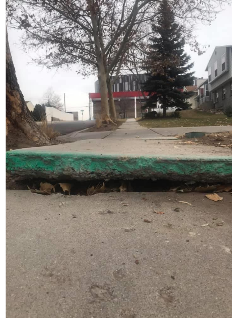
Category: Raised Concrete Ranking: 1