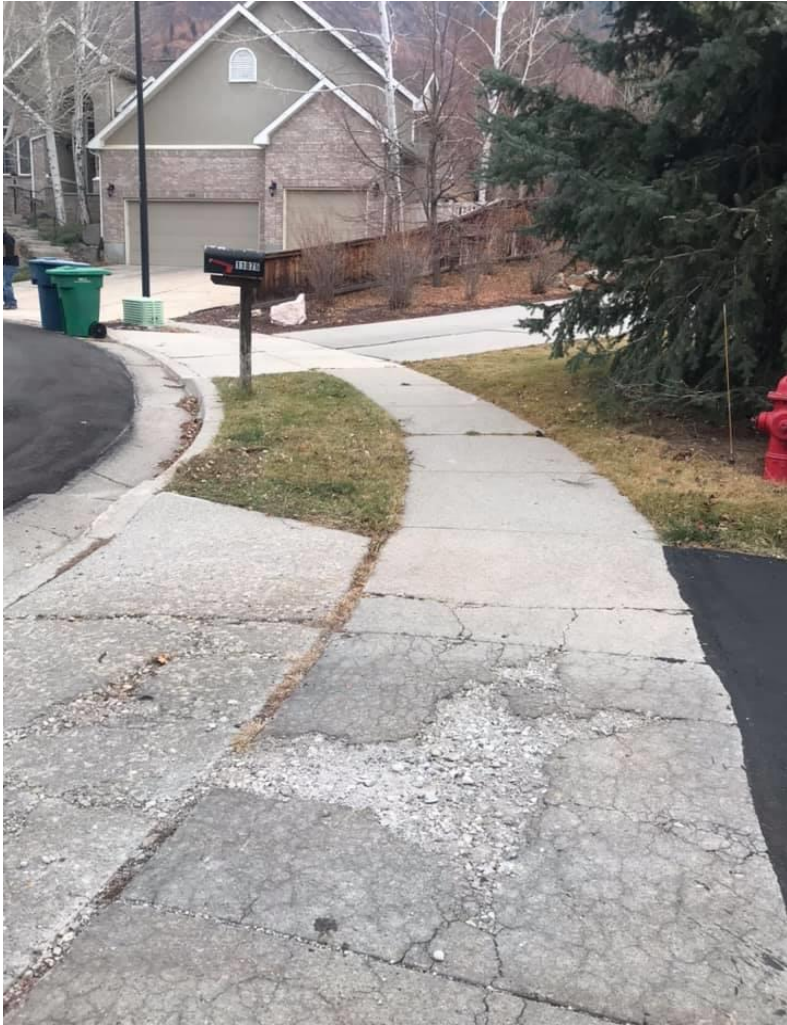
Category: Spalled Concrete Ranking: 2