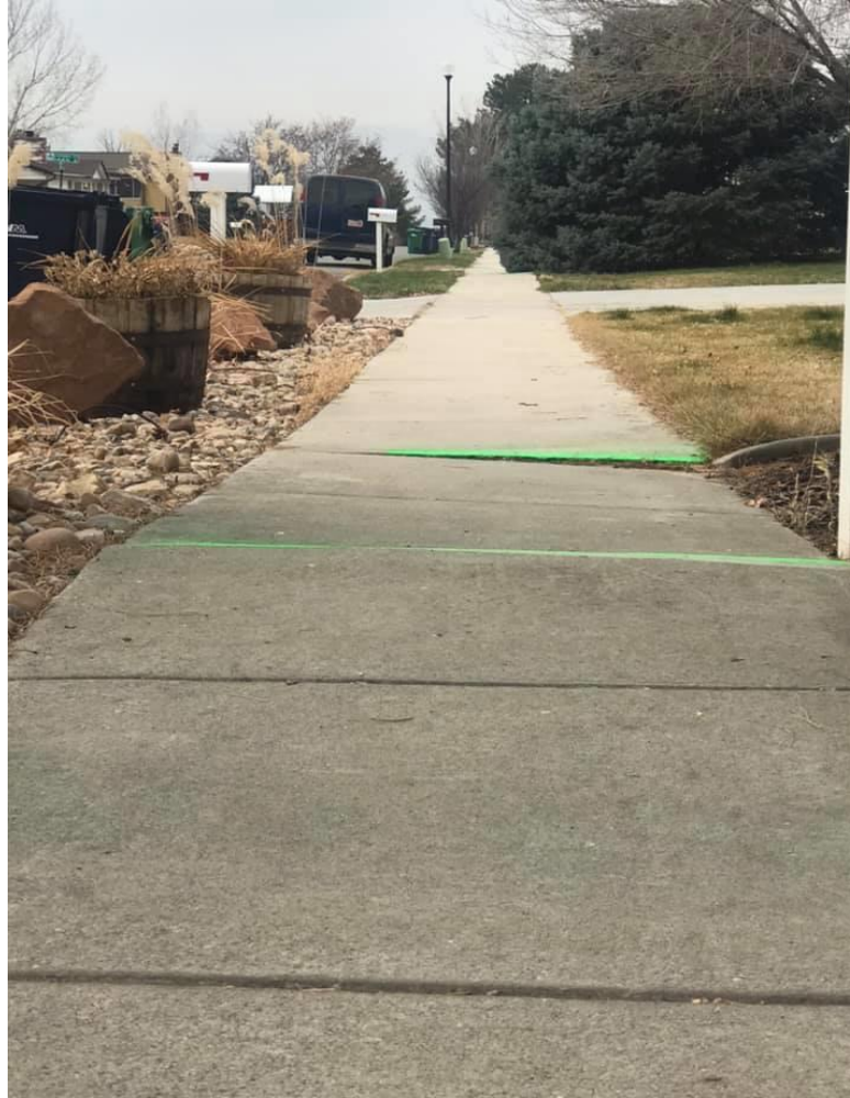
Category: Sunken Concrete Ranking: 3