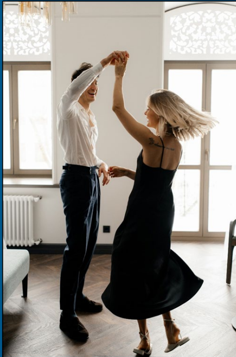
Adult Group Activities (e.g. Social Dance Class)