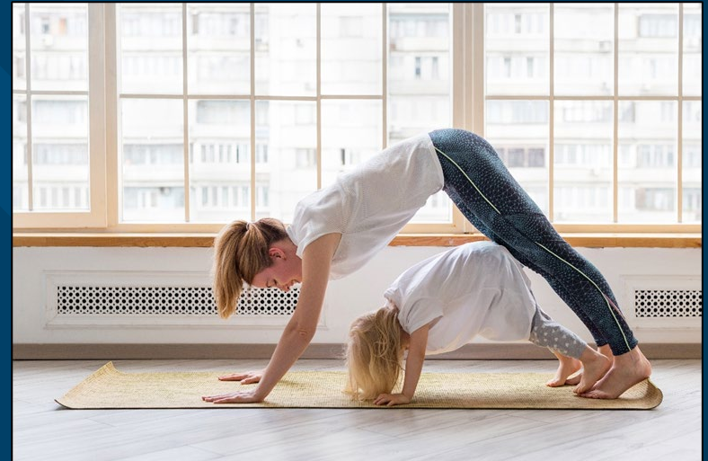
Parent-child (e.g. Mommy & Me)