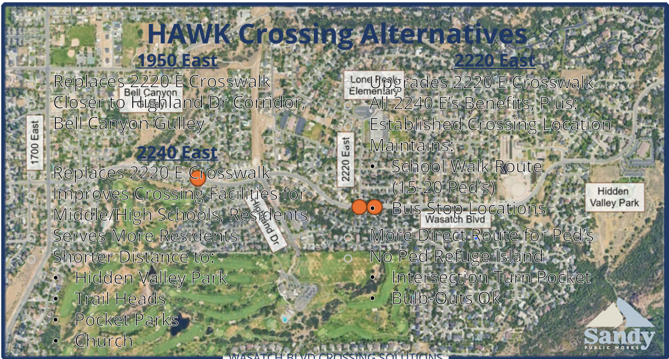
WASATCH BLVD CROSSING SOLUTIONS