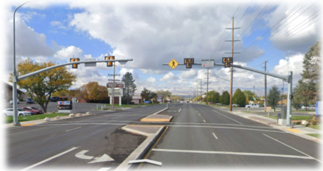
HAWK Crossing at 840 E 9400 S, installed 2022