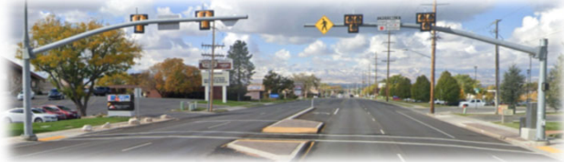
WASATCH BLVD CROSSING SOLUTIONS