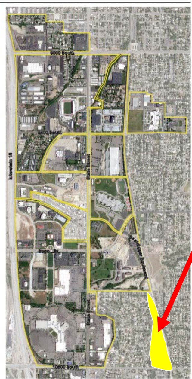
Figure 402 Cairne Area M