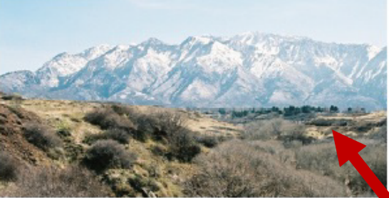
Figure 446 - View from inside Dimple Dell Park