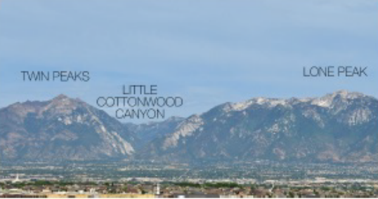
Figure 445 - Mountain Peaks