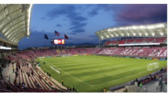
Figure 448 - Rio Tinto Stadium